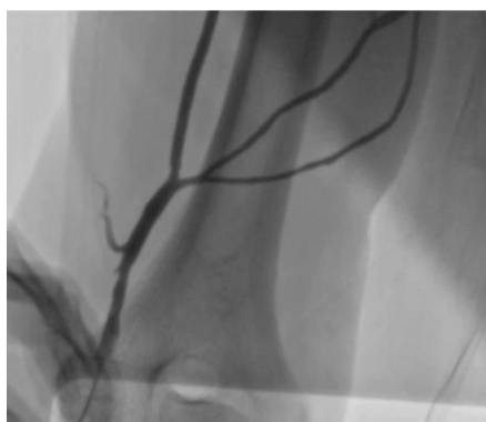
Figure 2. Vascular abnormalities of v. basilica .