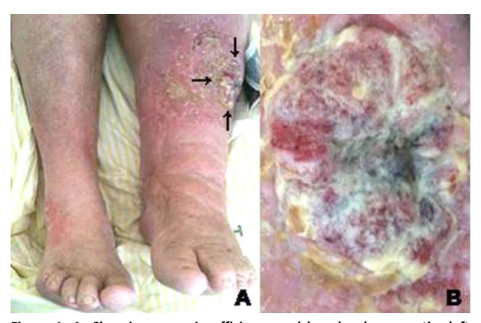
Figure 1. A: Chronic venous insufficiency and lymph edema on the left lower limb, and a large irregular ulcer (arrows) with inflammatory features and bleeding in the anterior lateral region; B: Conspicuous fungating mass, which developed on the border of a non-healing wound showed in detail.

This local infection was initially treated with ceftazidime, which was further changed for ciprofloxacin plus clindamycin. Furthermore, the tumor was removed, and the histopathology study of surgical samples revealed a poorly differentiated squamous cell carcinoma (Figure 2). The tumor was infiltrating the reticular dermis without vascular invasion, but involving the excisional margins. Marjolin's ulcer was then characterized, and the patient was referred to Oncology Division for specialized treatment, including neo adjuvant chemotherapy and rescue surgery with limb preservation.