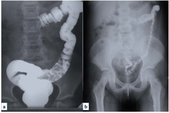
Figure 2. X- ray examination: a – contrast barium enema (front view); b – post-evacuation radiograph (front view).