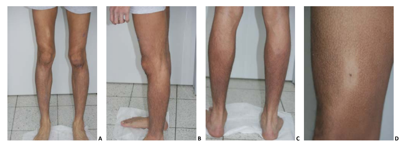
Figure 1. Cutaneous lichenoid amyloidosis with papules coalesced into plaques on legs and hips (A–D). Note the absence of lichenoid lesions on the nonscratched skin area (around melanocytic nevus on the anterior surface of the hip) (A, D).