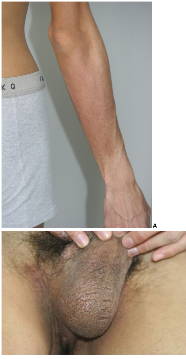
Figure 2. Cutaneous lichenoid amyloidosis with papules coalesce into plaques on forearms (A); presence of lichenoid lesions on the scrotum (B).