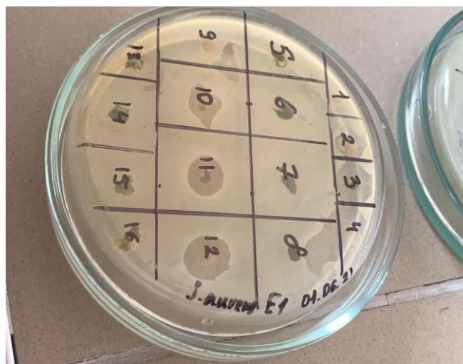
Figure 1. Antibacterial effect of pastes prepared from calcium (light clay) and sodium (dark clay) montmorillonites of Gerpegezh deposit in KBR on Staphylococcus aureus strain.

Statistical significance was calculated using Student's t-test. In tables and graphs, data are presented as mean \pm standard deviation.